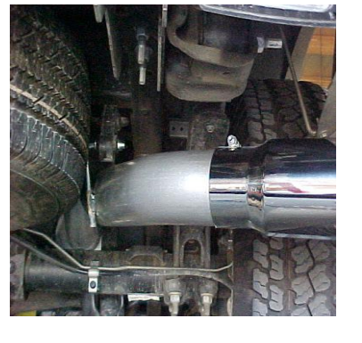
SLIDE EXIT PIPE # E ONTO OVERAXLE TAILPIPE INSERT WELDED HANGER INTO RUBBER GROMMET. USE CLAMP # I TO SECURE PIPES TOGETHER. DO NOT TIGHTEN. ROTATE PIPE UNTIL LEVEL.

NEXT, INSTALL BAND CLAMP # H ONTO MUFFLER INSERT HANGER INTO RUBBER GROMMET. USE BOLT KIT PROVIDED FOR BAND CLAMP, DO NOT TIGHTEN.